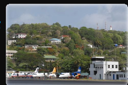
George F. L. Charles Airport

Visit our Website at www.slaspa.com for Aircraft, Ferry, Cruise and Cargo Vessel Schedules