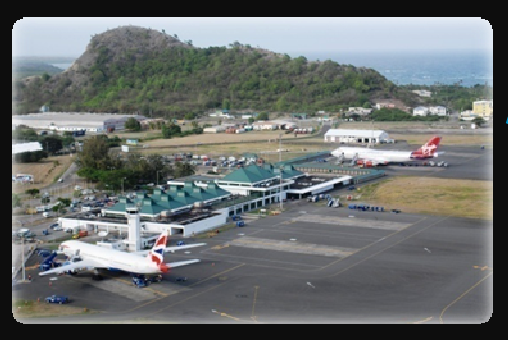
Hewanorra International Airport